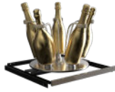
Fixed presentation shelf APRESMAGNUMG 5 bottles 10kg