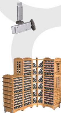
Corner of a room Length 1 st wall section : 2215,7mm Length 2 nd wall section : W1631,7mm x D584 x H2008mm