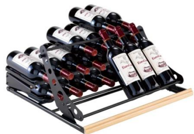
AOPRESAR kit** Compatible with MV1