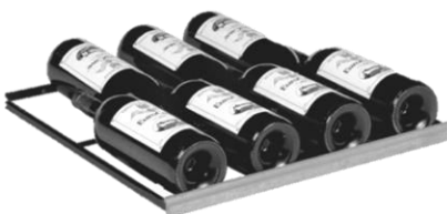
Sliding shelf MDS L40