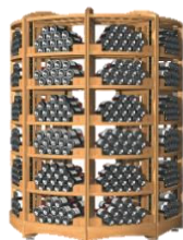
Around a pillar Ø 1800mm H2060mm