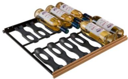
Sliding shelf* MDS L60 ACMS